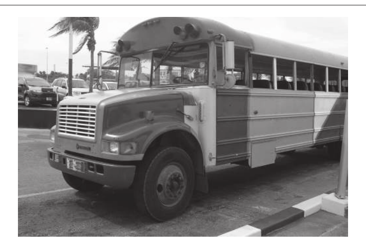
Fig. 2 for Question 2